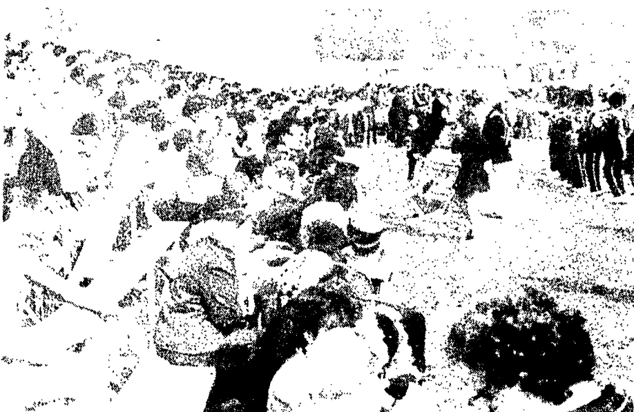
PART OF THE HUGE crowd of alumni and students watch the visiting bands strut their stuff during Homecoming Day '84.