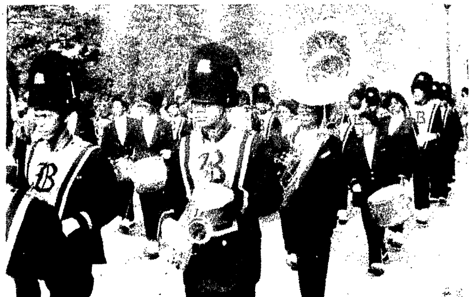
BALTIMORE CITY COLLEGE Marching Band steps smartly across the Lincoln campus during Homecoming Day '84.